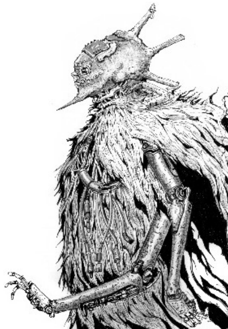
Figure 1. The Mono (character) is designed and depicted based on a mini dream by the author.

The organism spoke to the artist again: 'You are dreaming, aren't you? You made this?' The artist watched everywhere at the boardwalk they were standing on. People were passing by us, unconcerned with their conversation. The voice came again very close and clearer, we know that you have been contacted by a certain individual. A man who calls himself Mono. Please see the figure of Mono in Figure 1. Whatever you think you know about this man is irrelevant. The matter of fact is that the Mono is responsible for acts of dream terrorism in more countries than any other man in the world. He is considered by many authorities to be the most dangerous man alive.